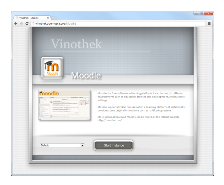
Figure 2. Vinothek Application Details page showing the selected Moodle application