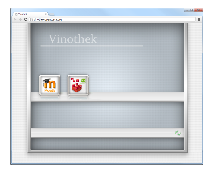
Figure 1. Vinothek Overview page showing all available applications

The Vinothek is implemented following the Web-based client-server architecture shown in Fig. 3. The Graphical User Interface (GUI) is based on Java Server Pages and HTML5. It communicates via a RESTful API with the server that delegates calls to the TOSCA Application Lifecycle Manager , which is currently dealing with the provisioning of applications only. We plan to extend this component in the future to support management and termination of application